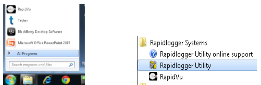
Figure 2: Running the Rapidlogger Utility from the program menu

The first step is to install the " Rapidlogger Utility " program on your PC. To install double click on the setup.exe file inside the Rapidlogger Utility folder on the CD.